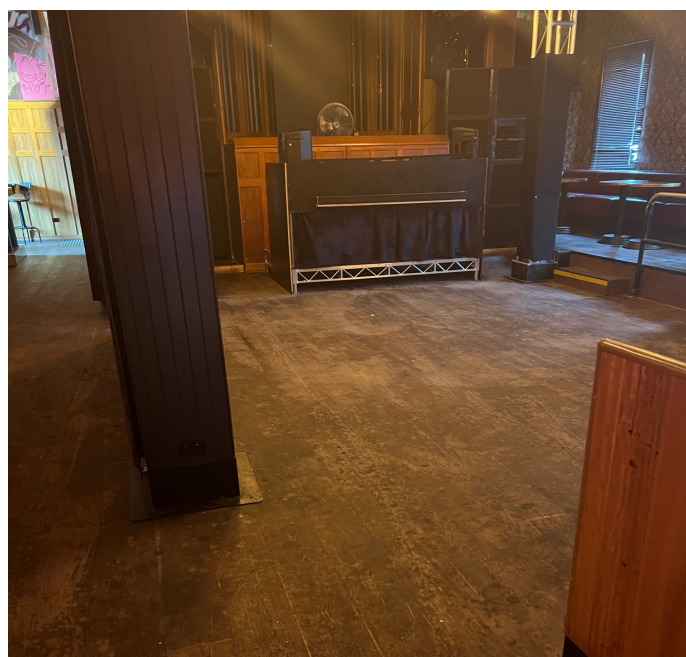
View after entry hall, facing right towards dancefloor (Seating booths pictured to immediate right)