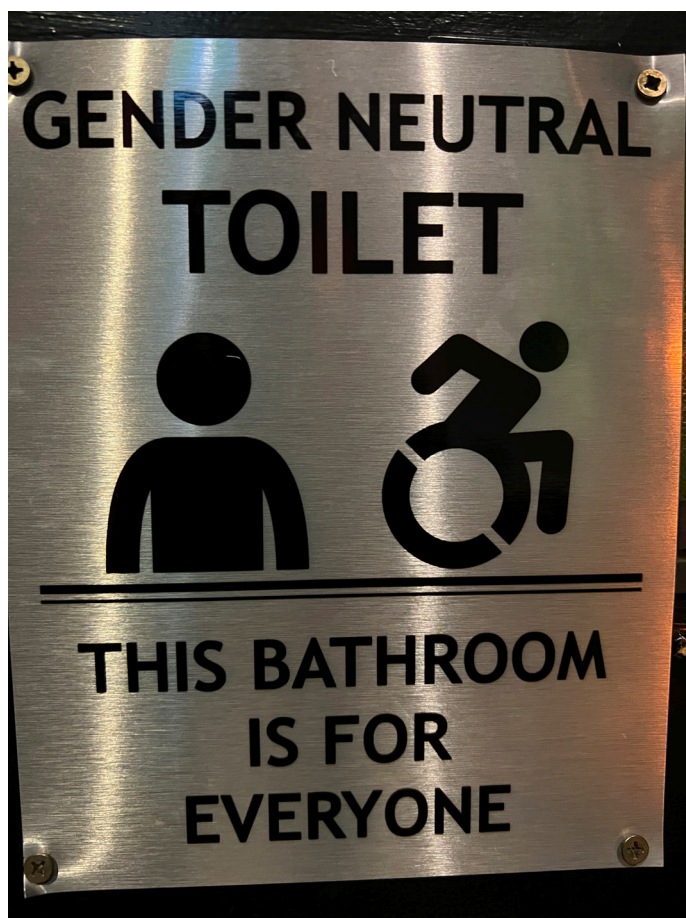
Close up of inclusivity signage on toilet.