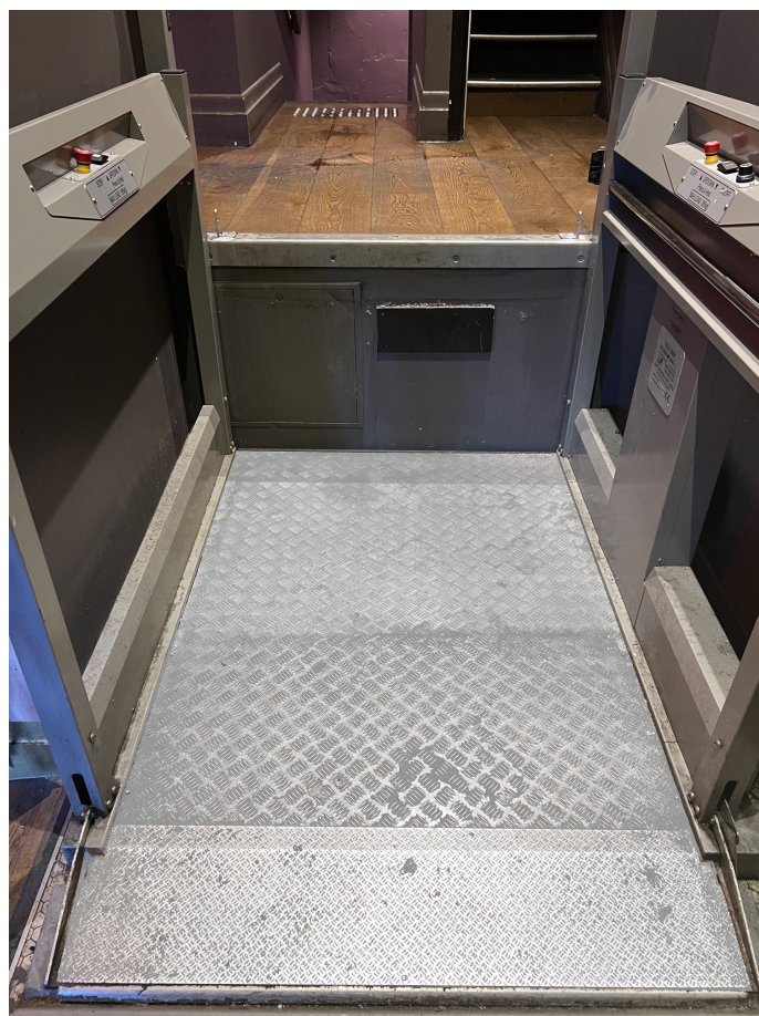
Wheelchair lift before access to First Floor. Max Load: 385 kgs