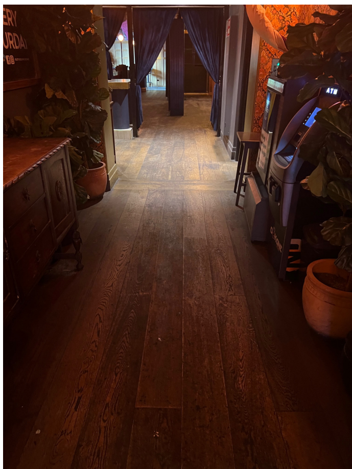
View of entry, after Wheelchair Lift.

There is no wheelchair accessibility to Level 2.