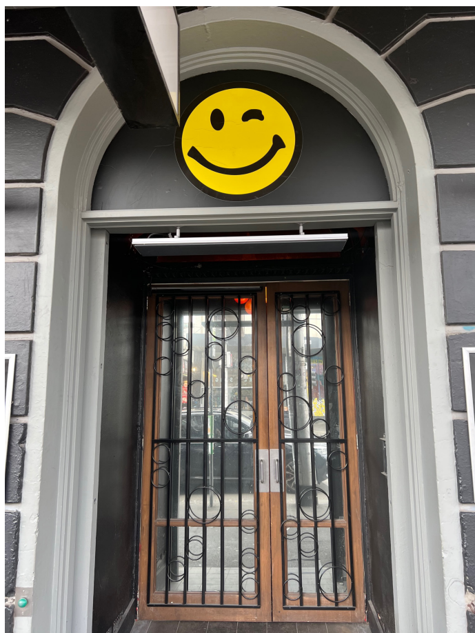
View of front door from Smith Street. Door open on event nights.

Entrance off Smith Street has a slight incline from street level. Wheelchair Lift gains access to first floor after ticketing area. Security stationed at door will be assist with lift operation.